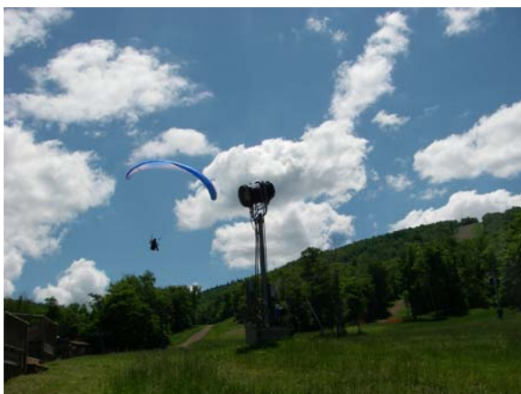
Ben landing at Timberline

disappointment in a decent is offset by just riding the lift back up and giving it another try.