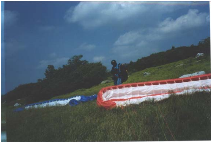
Ben on Micky's launch

Micky's is located 6 miles West of Harman WV on Route 33 to Elkins, WV, There is a blue farm gate on the right just before the hill. There will be some streamers on a stick beside the gate.